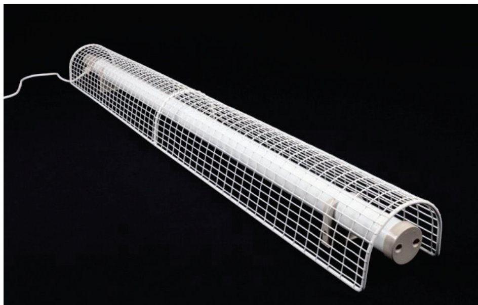
AIANO STG41 tubular heater guard for the new Dimplex ECOT4FT tubular heater with thermostat