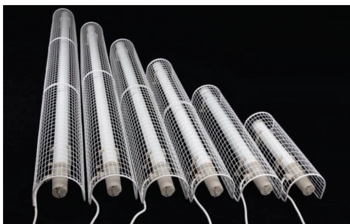
The complete family of AIANO guards and Dimplex tubular heaters

AIANO wire guards are manufactured in the UK from British and European Union steel.