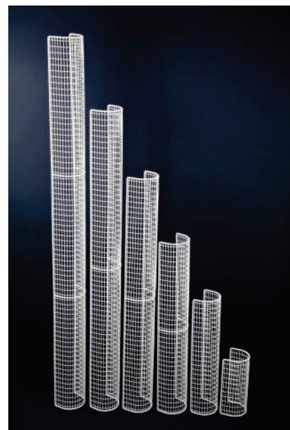
AIANO tubular heater guard family ranges from 1ft to 6ft